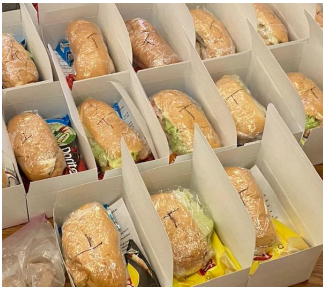
Sub sandwiches were made and boxed by volunteers at the First Congregational Church