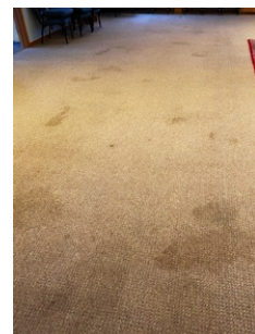
Before – yikes!

Joy: Beckers Carpet Cleaning was able to remove the many coffee stains from the Sanctuary carpet ☺