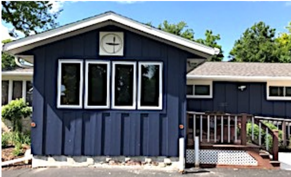
After: Primed & painted