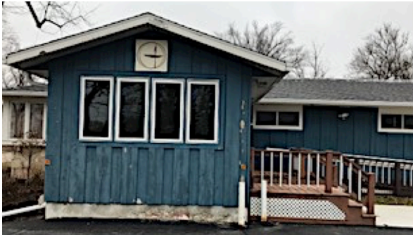
Before: Fading & peeling paint