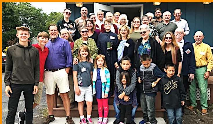
The annual water sharing ceremony combined with the Harvest Festival. (See page 5 for a recap of September)