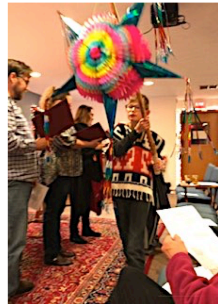
Annual Festival of Lights in Photos 12/20/18