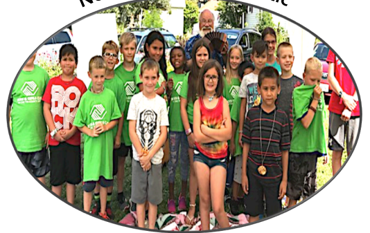
3rd annual Kids Camp – Not-So-Fantastic-Plastic