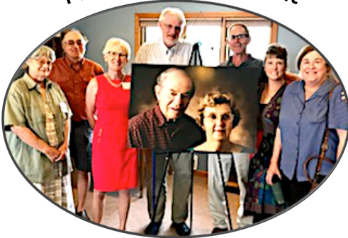
PLUUF Founders Event