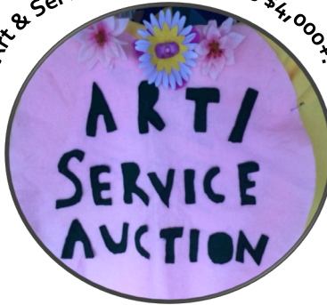
Art & Service Auction raises $4,000+!