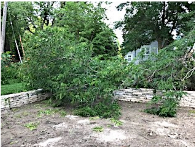
A gigantic branch fell on our newly excavated area