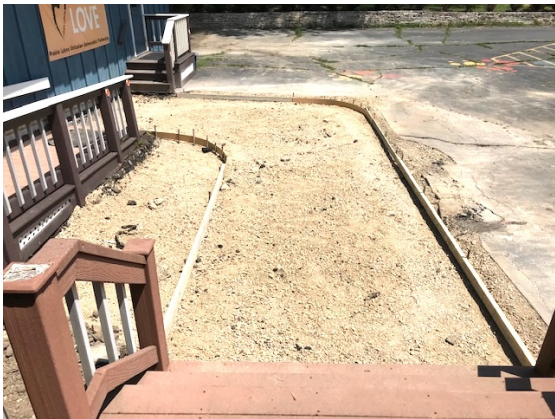
Asphalt was removed between the two entrances