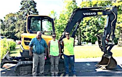
Kinas Excavating was hired by PLUUF to recreate the area around the building