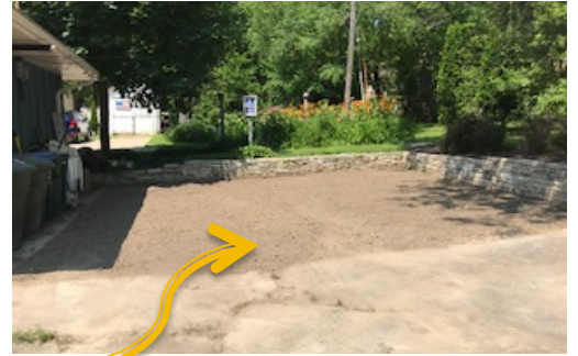
This area will be planted in grass and will be used as a meditation area, or rain garden, or kids play area, or...?