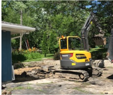
Asphalt was removed from the parking lot on the east side of the building where the handicapped parking was located.