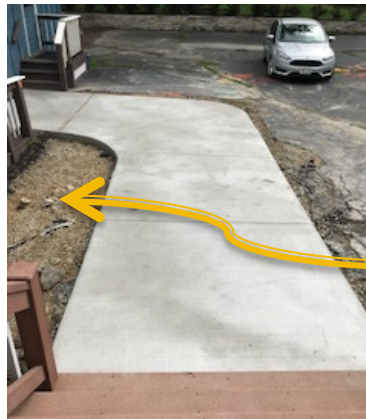
Rock's Concrete Service poured the new walkway and left a space near the ramp and filled with dirt. Soon it will be planted with beautiful flowers.