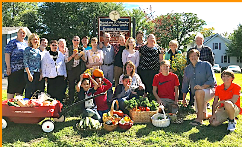
The annual water sharing ceremony combined with the Harvest Festival. See page 6 for a recap.