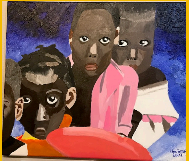
What Breaks Your Heart?

Worship Service & Art Exhibit 7/8 (Details on page 4)