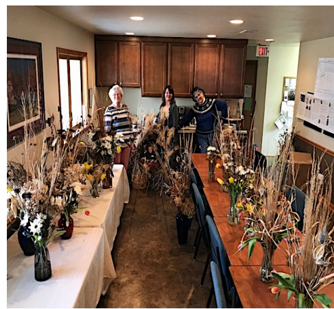
Voila! Plants are arranged in vases and ready for delivery to the college.