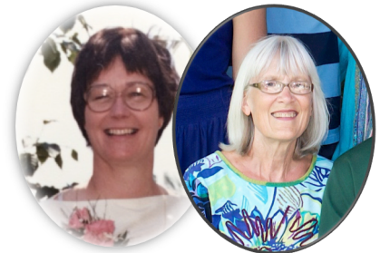
"Service of the Jeans" and more on page 7