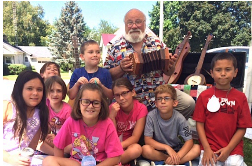
PLUUF Kids Camp page 2