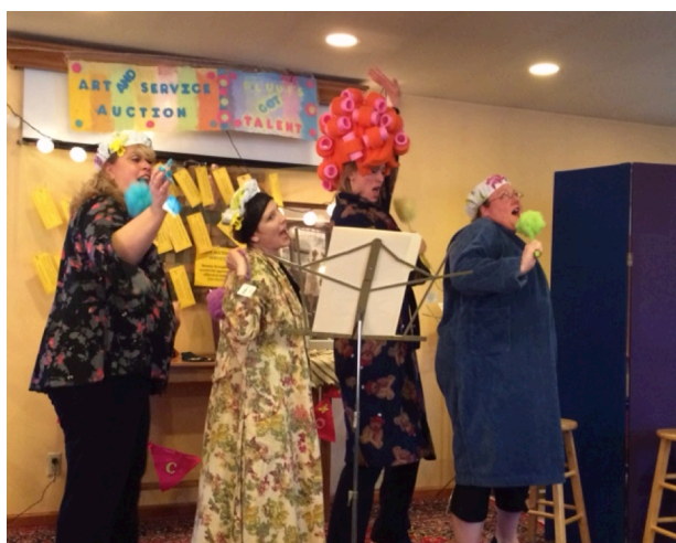
An evening of hilarious skits!